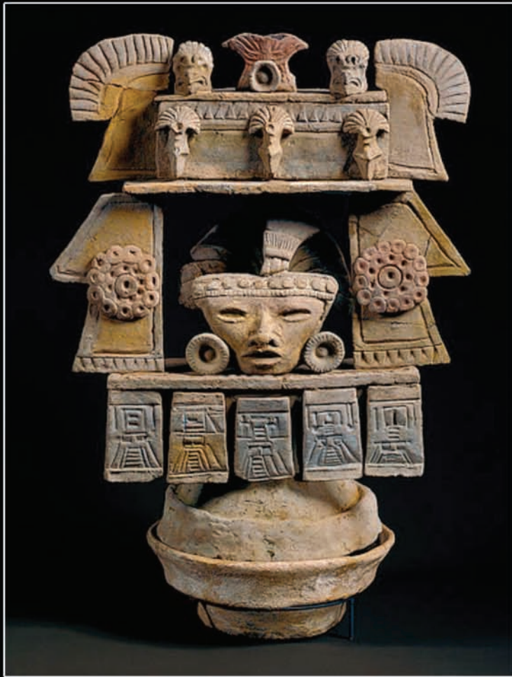
Teotihuacano Incensario, 150-550 AD 42 cms x 33 cms, Staatliche Museen zu Berlin

For questions about this event, please contact the organizers: AHSMeso2012@gmail.com